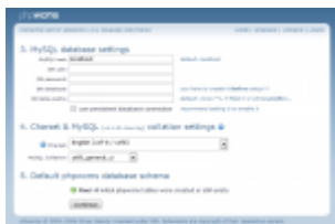
Image 8 - Tables were created