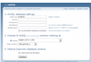
Image 6 - Creation of the Tables