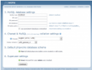
Image 10 - Confirm Administrator