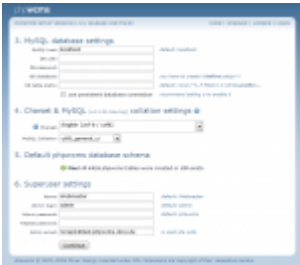
Image 09 - Create Administrator