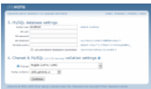
Image 5 - Charset